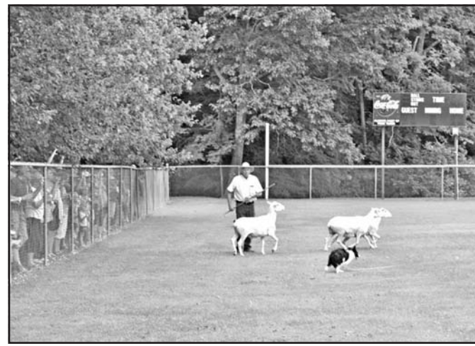
A border collie and sheep demonstration from a past Scottish Festival at Meeks Park.

The Dance Pavilion will be another exciting place to be, as folks can marvel at the amazing footwork of the Royal Scottish Country Dancers and the Glencoe Highland Dancers.